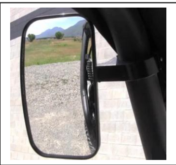
19. Note: For additional information and installation videos, refer to the Rocky Mountain ATV website at www.rockymountainatvmc.com.